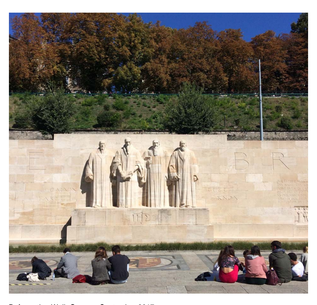
Reformation Wall, Geneva, September 2017

This address is dedicated to an American friend of Ridley Hall whose generosity made it possible for me to spend two days in Geneva researching Calvin.